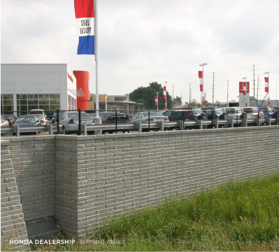
HONDA DEALERSHIP NEWMARKET, ONTARIO.